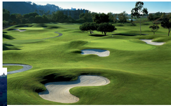
Riverwalk Golf Club, San Diego, CA

Registration—8:00 a.m. • First Tee-Off—8:30 a.m.